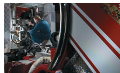
PUC full-tilt service access