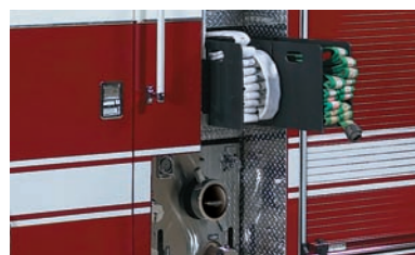
Chest height crosslays